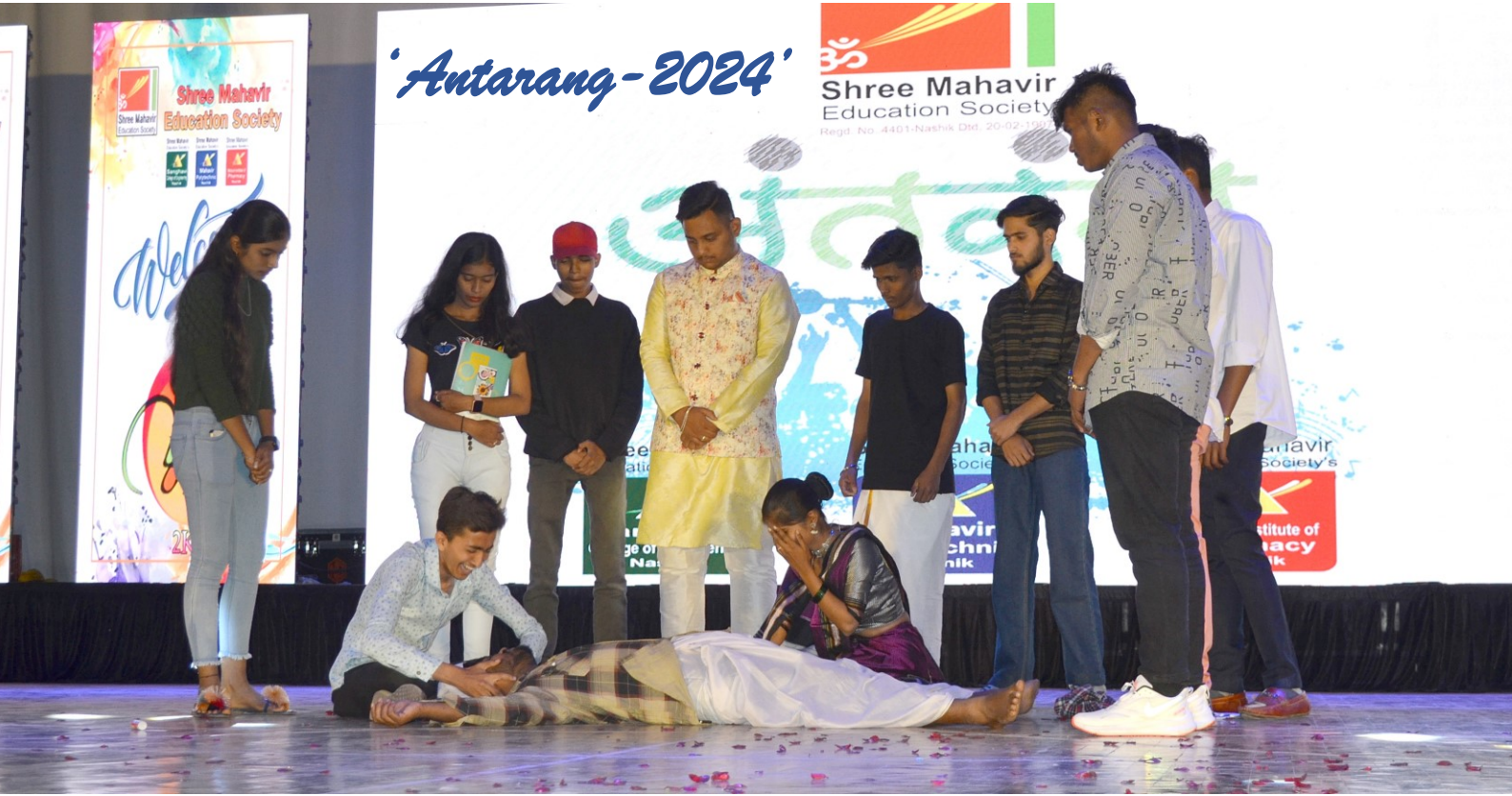
“Antrang-2024” unleashed the talents of students.